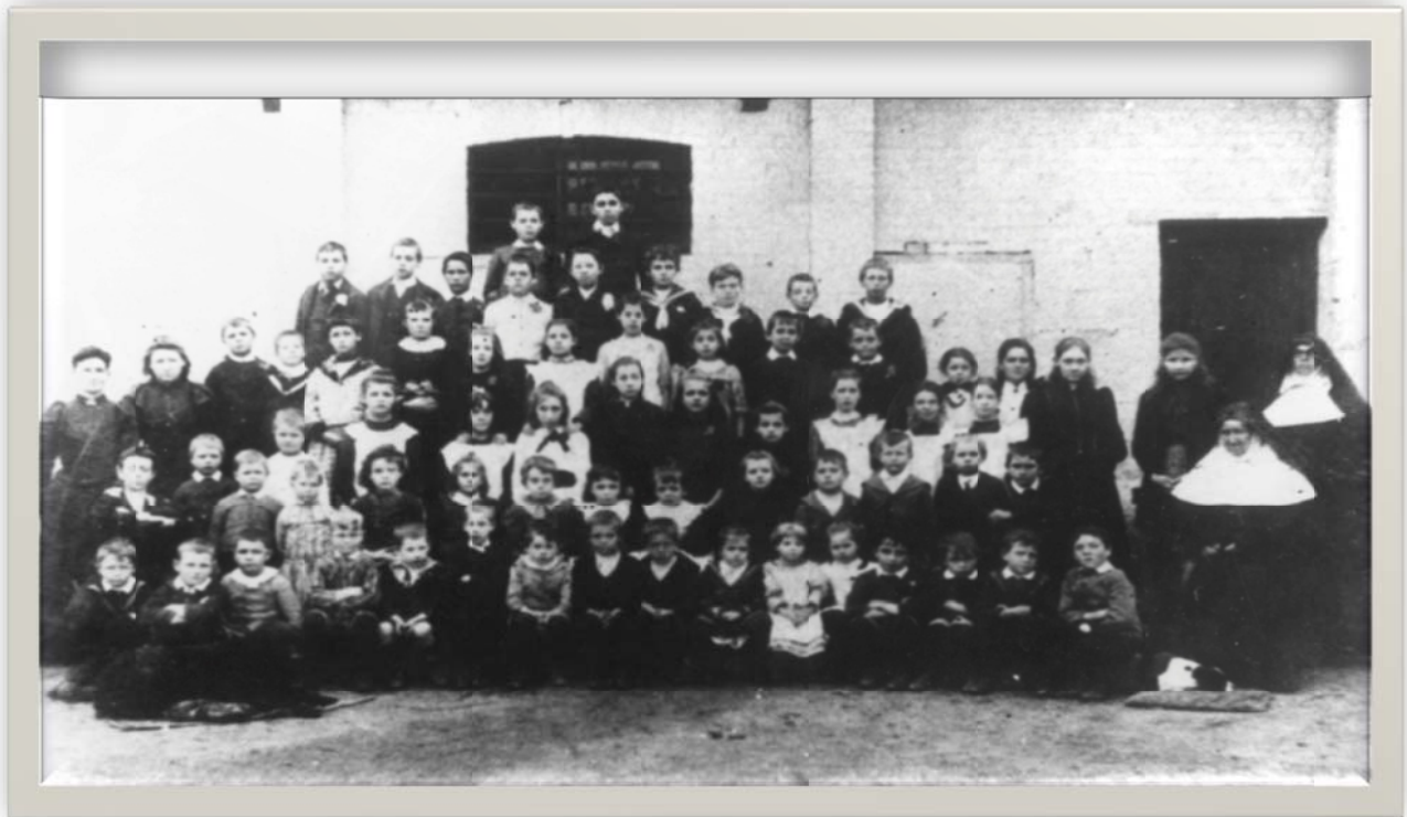
Photo of the entire school enrolment taken outside the "classroom" in Guildford. It had been the "place of residence" of Fenians during part of their contribution to the building program in the Colony.