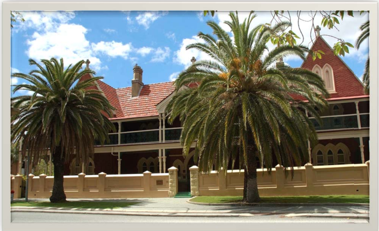
Convent opened in 1871 as it stands today 2011