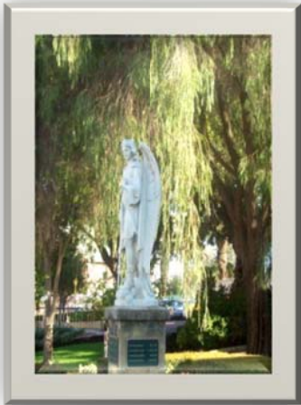
Site of the Pioneer Sisters' Graves Victoria Square Perth.